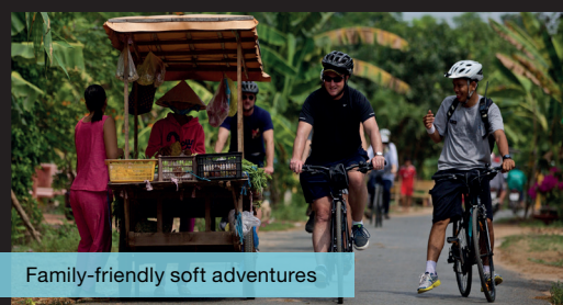
Family-friendly soft adventures