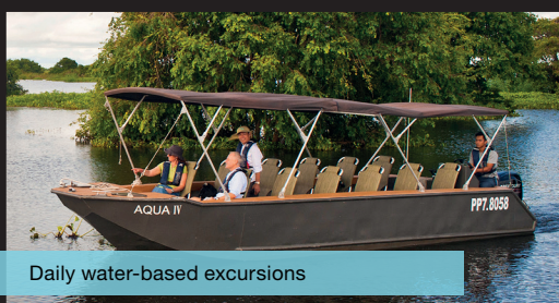
Daily water-based excursions