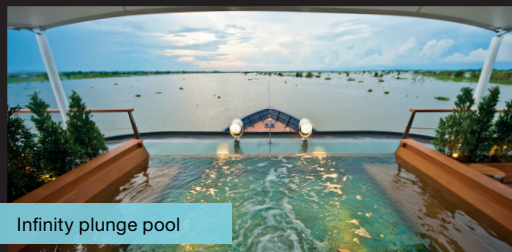
Infinity plunge pool